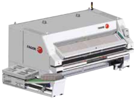
"PHOENIX" IRONER DRYER with COMPACT STACKER to the left and front output.