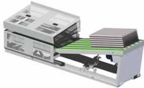
COMPACT STACKER Roll-Off