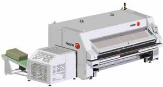
"PHOENIX" IRONER DRYER with STACKER to the left and back output.