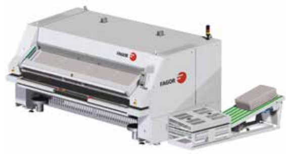
"PHOENIX" IRONER DRYER With COMPACT STACKER to the right and back output.