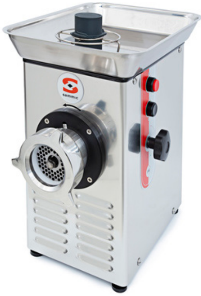
Plate diameter: Ø 82 mm Inlet mouth diameter (1) : 60 mm Total loading: 740 - 1100 W Refrigerated mincer: no